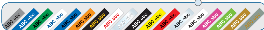
Labels shown are illustrative only. Actual output (such as font and margins) varies.