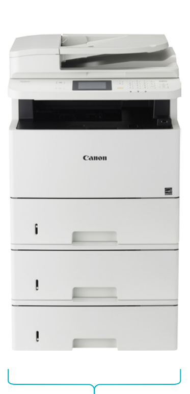
Main unit + 2 Paper Feeder Units PF-45