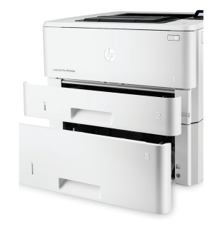
HP LaserJet Pro M402dn