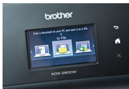
Secure Function Lock (SFL) allows user restrictions to be put in place for function management and improved security.