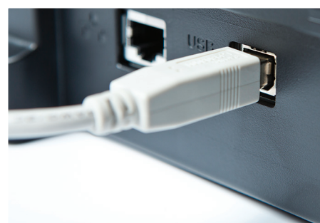
The scan to USB host feature allows the connection of an external storage flash drive up to 64 GB so users can instantly make their scanned documents portable.