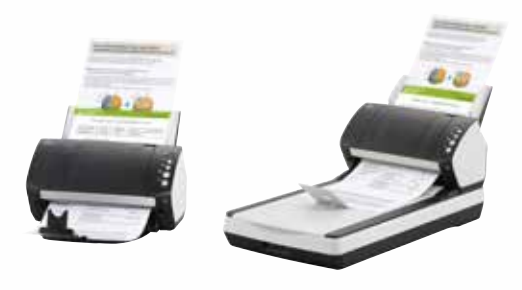
fi-7140 / fi-7240 – A4 Portrait at 300 dpi 40 ppm / 80 ipm Scan mixed batches up to 80 sheets